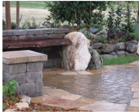
A recent Madrone Landscapes exhibit of sustainable landscape practices at San Luis Obispo Botanical Garden

So many things one can do in the landscape...and along with the functional features, one must consider the materials needed to create your landscape. This has to do with style, as well as function, not to