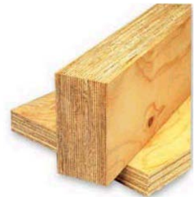
Laminated Veneer Lumber (LVL)

Laminated Veneer Lumber (LVL) – is composed of thin layers or veneers of wood glued together and sawn to make dimensional lumber in sizes ranging from 2x4's to 4x18's or larger by special order. This class of lumber is used as studs, headers, rim joists, beams, columns, and girders in floor framing and as